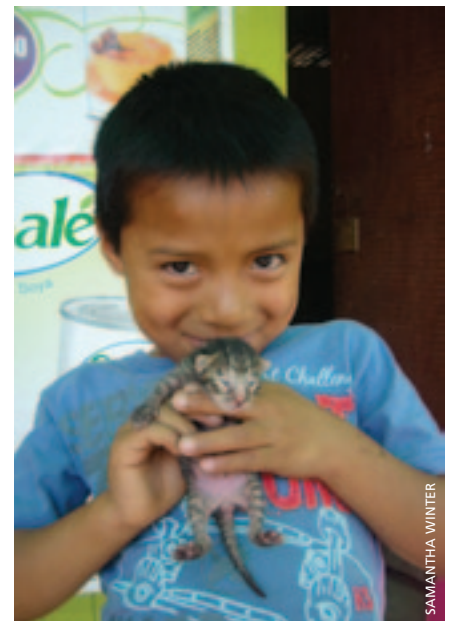
The very idea of an animal shelter is often a foreign concept to people who are struggling themselves just to get by. But this little boy seems very taken with a tiny kitten at the site of a mobile clinic run by Animazul, an animal shelter located about an hour outside Lima.